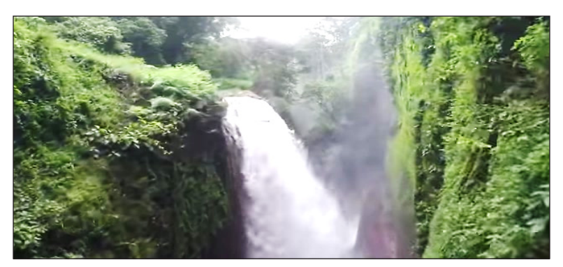
Figure 1. Kalibendo waterfall hinted life

Water has connotative meaning as the giver of life and freshness in enjoying life. Water flowing in the form of waterfalls offers hope in life. The green colour gives peace. This is shown in Figure 1.